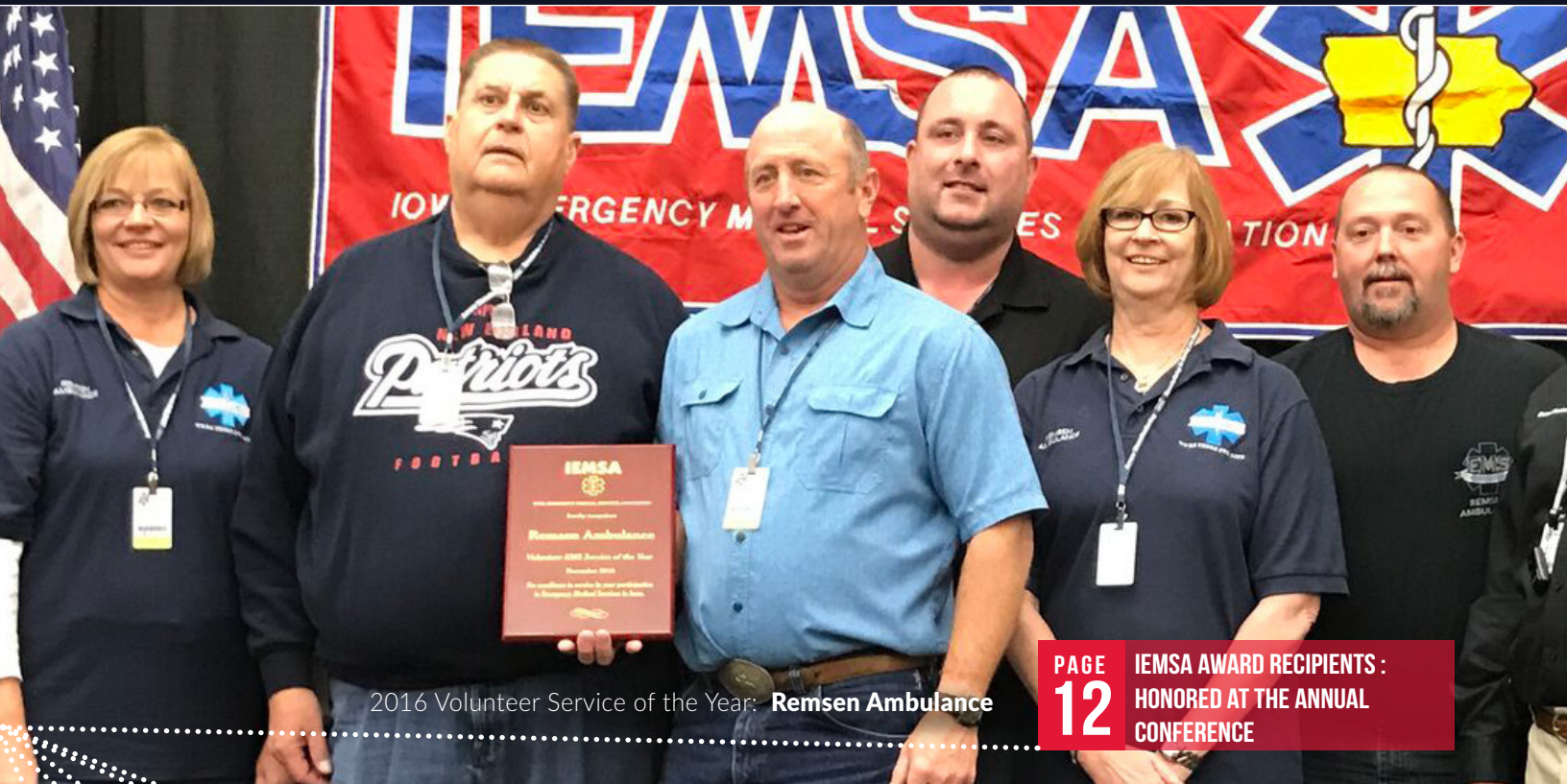
2016 Volunteer Service of the Year: Remsen Ambulance

PAGE 12 IEMSA AWARD RECIPIENTS: HONORED AT THE ANNUAL CONFERENCE