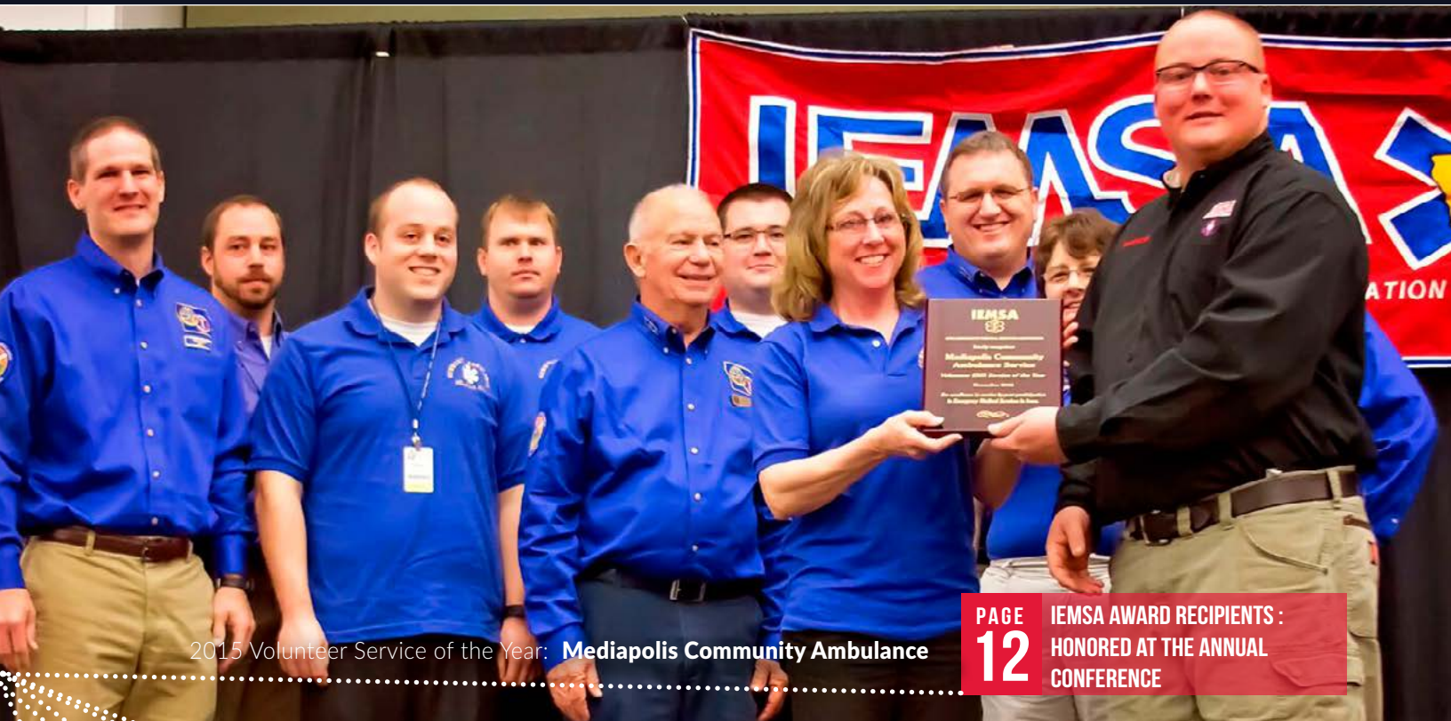
2015 Volunteer Service of the Year: Mediapolis Community Ambulance